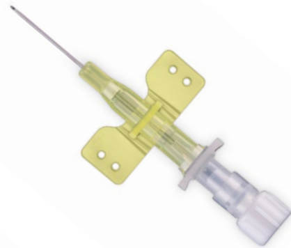
Neo Venopic 1