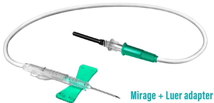
Mirage + Luer adapter