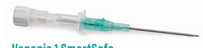
Venopic 1 SmartSafe