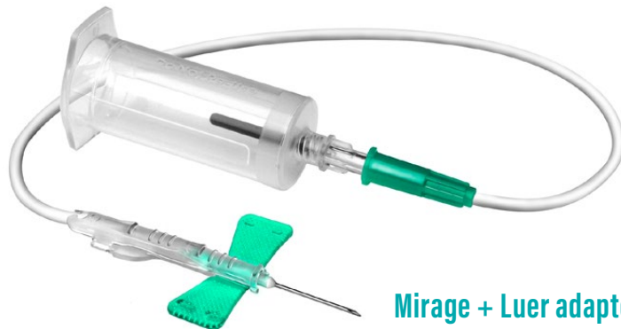
Mirage + Luer adapter + Holder