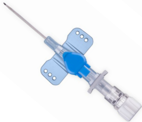
Neo Venopic 2